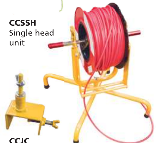
CCJC Joist clamp